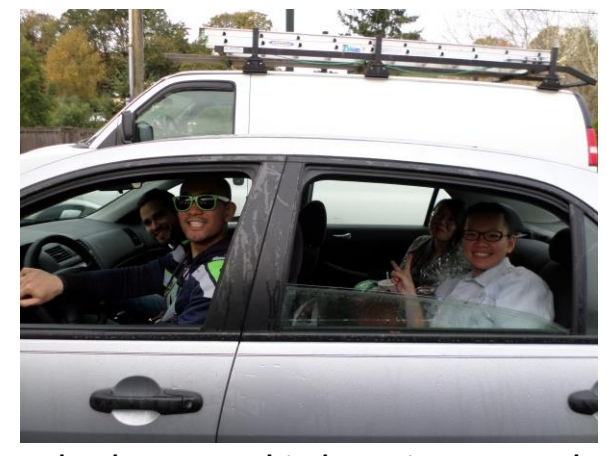
The long road is best journeyed with great company!