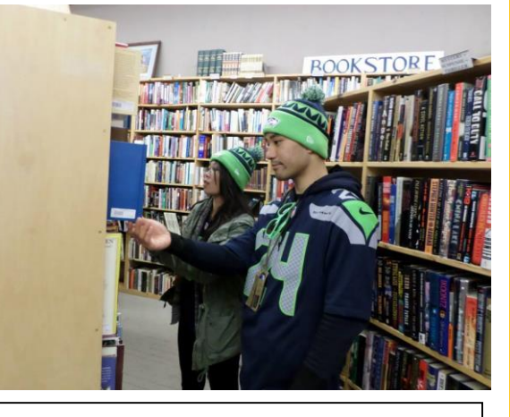
Bailey's Bibliomania Books