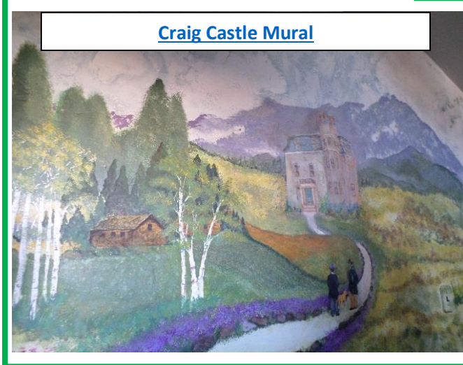
<u>explore</u> nearby attractions recommended by locals!!!